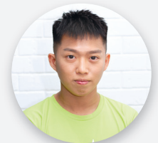
Lenz 012-510 0221