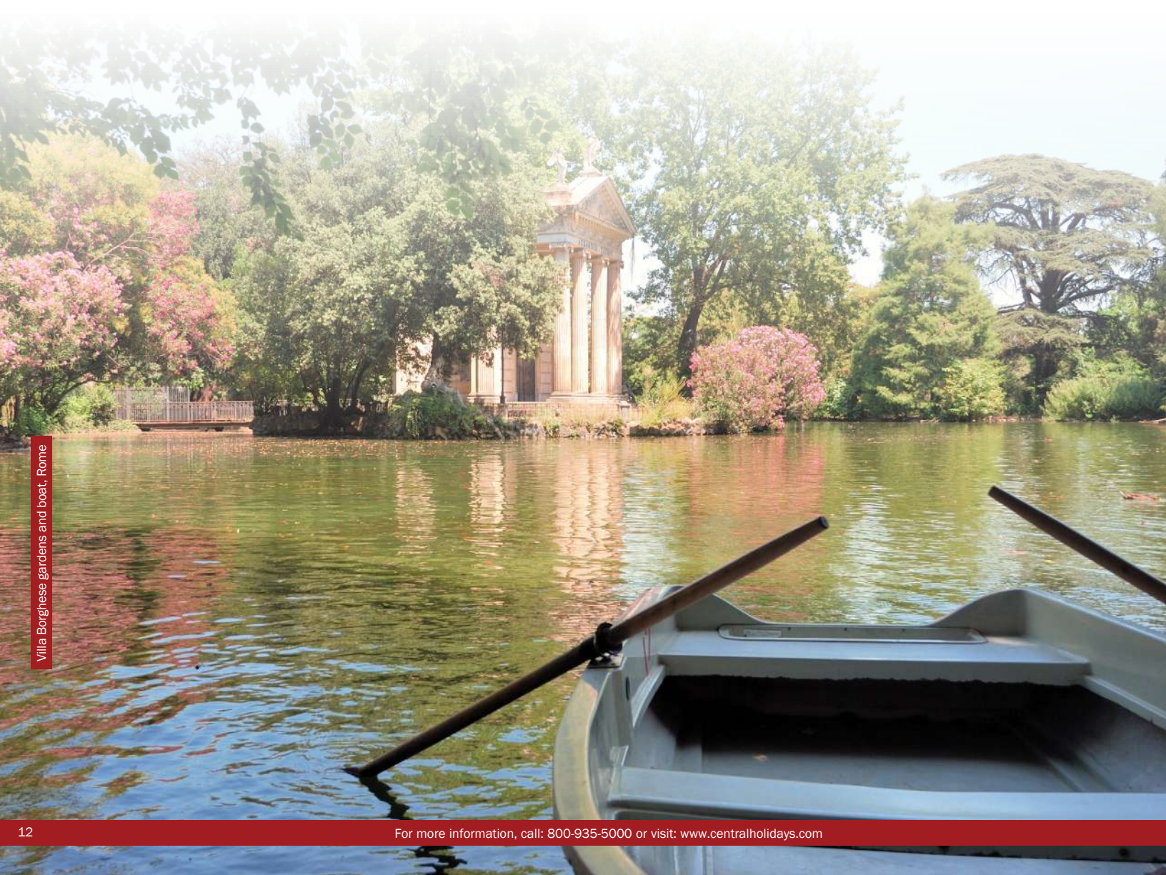
Villa Borghese gardens and boat, Rome

(*) optional tours are subject to availability and minimum number of participants to operate. Private tours are available, call us for details.