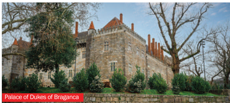
Palace of Dukes of Braganca

Capital city of Lisbon • Old quarter of Alfama • Belem quarter • Belem Tower • Church & Cloisters of the Jeronimos Monastery • Fátima • UNESCO world heritage site medieval village of Sintra • Royal Sintra National Palace • Cabo Da Roca – most western point of continental Europe • Palace of Dukes of Braganca • Fado Show • Douro River • Biblioteca Geral Da Universidade De Coimbra • UNESCO World Heritage Site - Ribeira district • An a Minho Province of Porto • Palace of Stock Exchange • Port Wine tasting • Sanctuary of Our Lady of Fatima • Chapel of the Shepards • Portugal's history, medieval & baroque style architecture, churches, stately building and worldwide religious pilgrimage sites plus much more