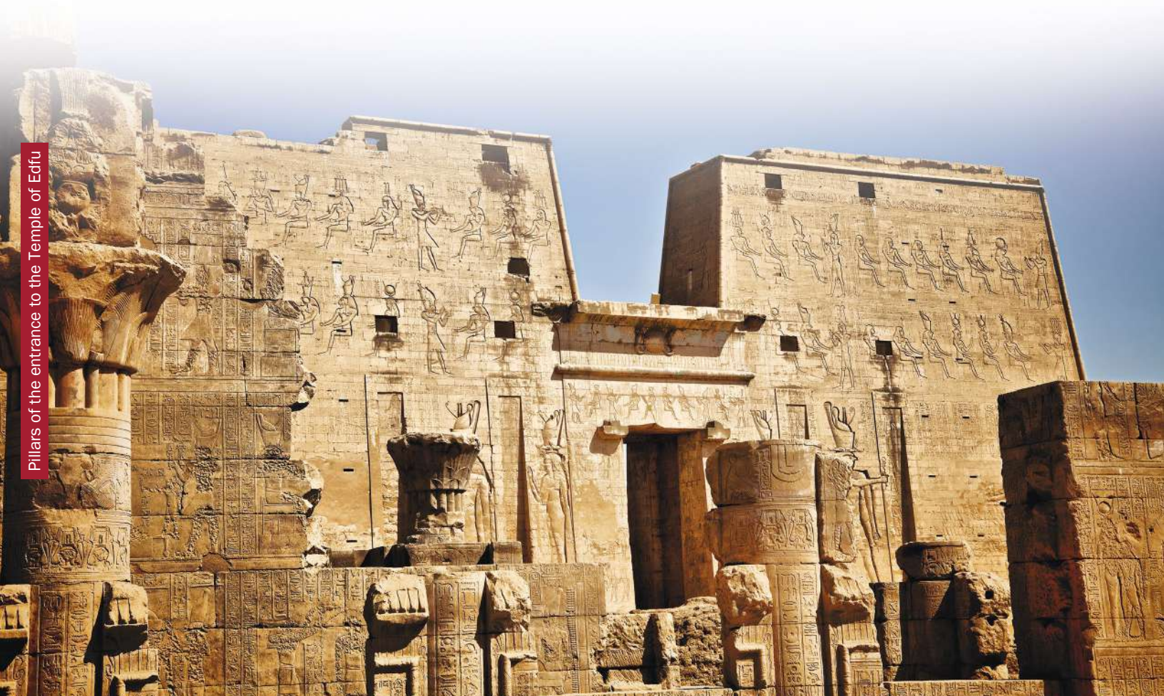
Pillars of the entrance to the Temple of Edfu