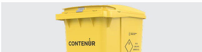
CUSTOMISATION BY THERMAL TRANSFER GRAPHIC