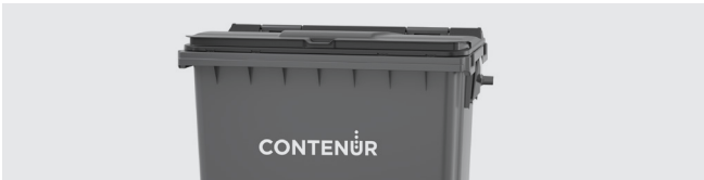
CUSTOMISATION BY THERMAL TRANSFER GRAPHIC