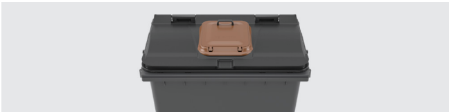
LARGE LID IN LID Usable dimensions: 400 x 330 mm