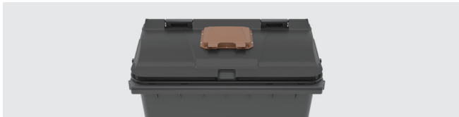
LID IN LID Usable dimensions: 300 x 250 mm