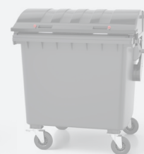
C1100 Roll Top