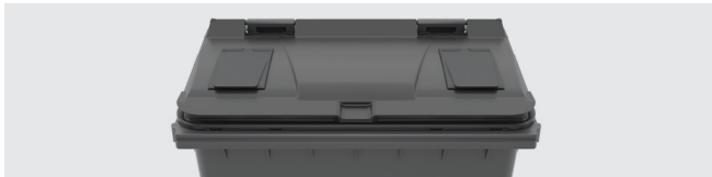
RUBBER LID IN LID Usable dimensions: 285 x 150 mm