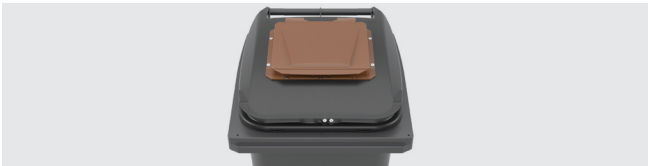
LID IN LID