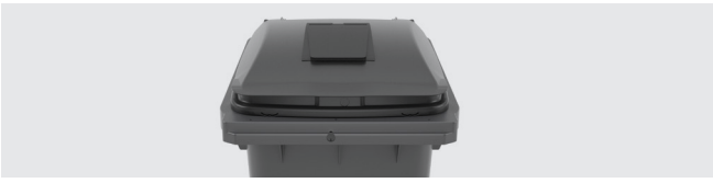
RUBBER LID IN LID