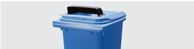
PAPER SLOT WITH COWL

Can be equipped with a range of accessories providing real solutions to every requirement.