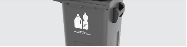
CUSTOMISATION BY THERMAL TRANSFER GRAPHIC