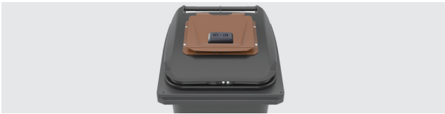
LID IN LID WITH ELECTRONIC LOCK