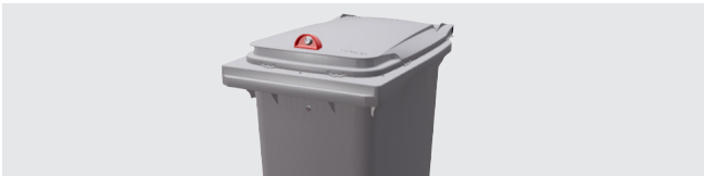
RED DOME LOCK