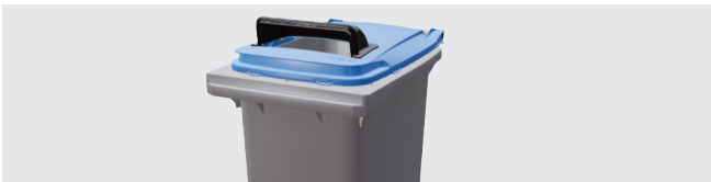
PAPER SLOT WITH COWL

Can be equipped with a range of accessories providing real solutions to every requirement.