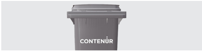
CUSTOMISATION BY THERMAL TRANSFER GRAPHIC