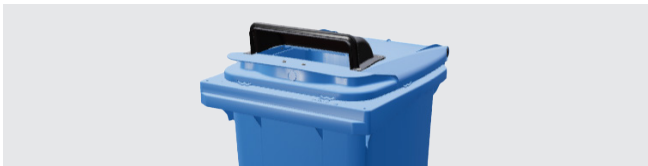
PAPER SLOT WITH COWL

Can be equipped with a range of accessories providing real solutions to every requirement.