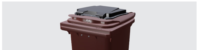
LID IN LID