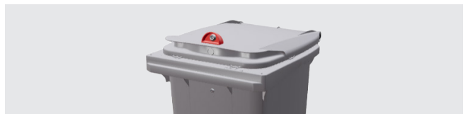
RED DOME LOCK