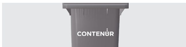
CUSTOMISATION BY THERMAL TRANSFER GRAPHIC