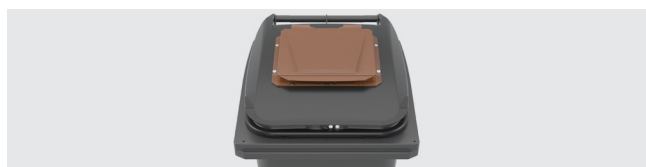
LID IN LID