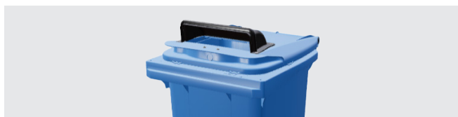
PAPER SLOT WITH COWL

Can be equipped with a range of accessories providing real solutions to every requirement.