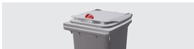
RED DOME LOCK