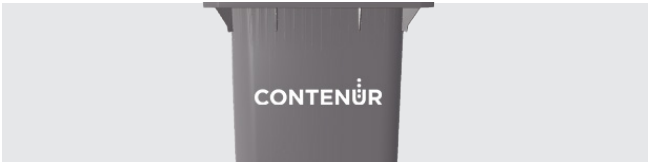
CUSTOMISATION BY THERMAL TRANSFER GRAPHIC