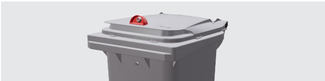
RED DOME LOCK