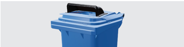
PAPER SLOT WITH COWL

Can be equipped with a range of accessories providing real solutions to every requirement.