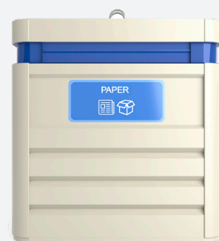
CUSTOMISATION WITH STICKER