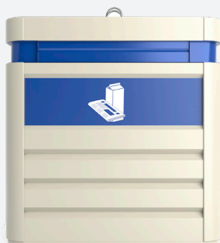
CUSTOMISATION WITH SILK SCREEN GRAPHIC