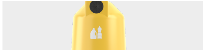
CUSTOMISATION WITH SILK SCREEN GRAPHIC