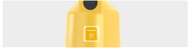
CUSTOMISATION WITH STICKER