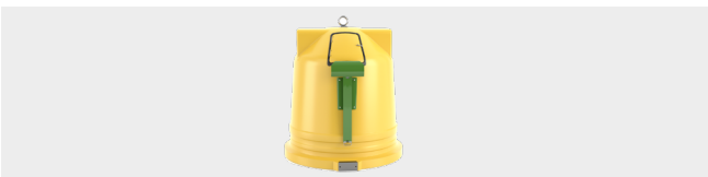
LARGE PRODUCERS SYSTEM