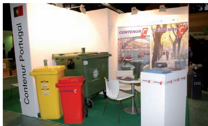
Showcasing our products in Angola.

Contenur's presence at Ambiente Angola forms part of the strategy for internationalisation, growth and customer outreach which the company has been working on for years.