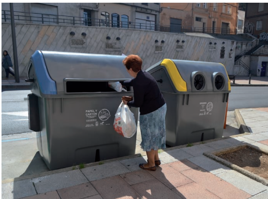
Member of the public recycling using the new Contenur container.

Ponferrada City Council in the province of León is now deploying new 3,200 litre side loading containers for the collection of municipal solid waste, paper and cardboard, and light plastics.