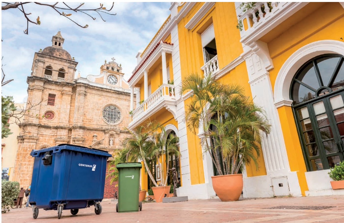
Contenur Containers in Cartagena de Indias (Colombia).