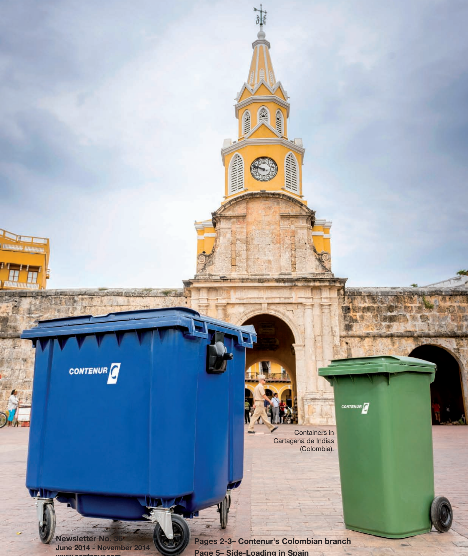
Containers in Cartagena de Indias (Colombia).