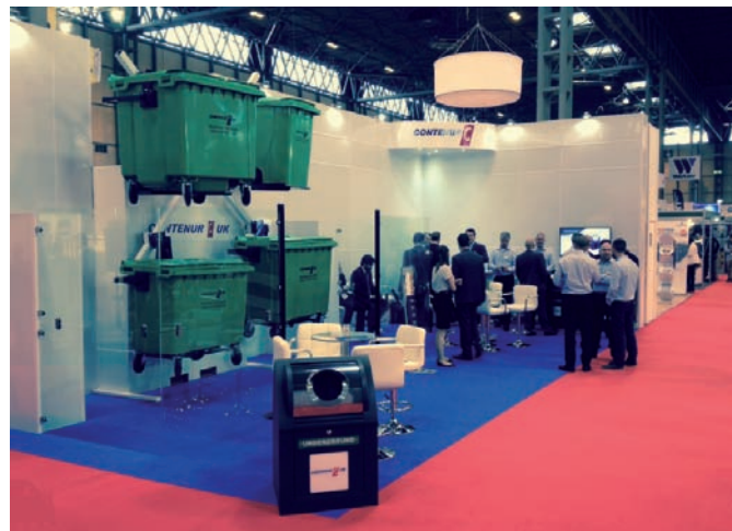
View of the new Contenur UK stand at the RWM trade show in Birmingham.

Contenur UK attended with a new, eye-catching stand, which stood out on account of the fact that all the containers were attached to a rotating wheel on one of the walls of our space. Customers also had access to comprehensive information on our range of products and services. The stand was staffed by Contenur UK's sales team.