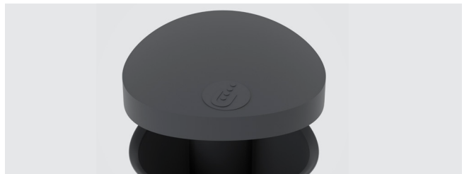
CUSTOMISATION ON THE LID