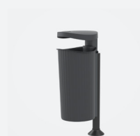
Italica 50 L