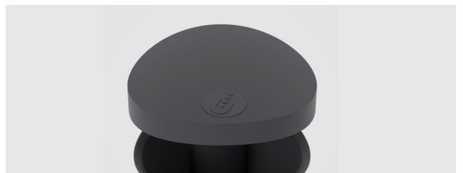
CUSTOMISATION ON THE LID