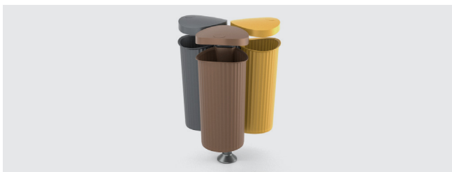
LITTER BIN ISLAND