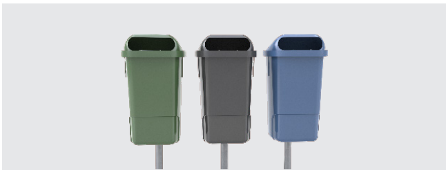
WIDE RANGE OF COLOURS

Can be equipped with a range of accessories providing real solutions to every requirement