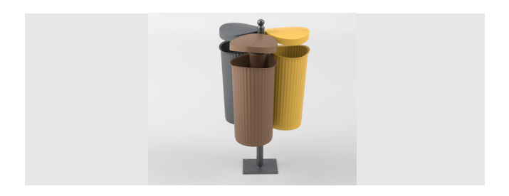
LITTER BIN ISLAND