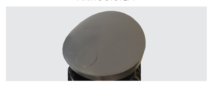
CUSTOMISATION ON THE LID